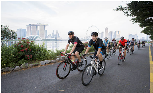
Gordon Ramsay leads a cycling clinic around Marina Bay