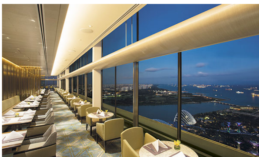
Club55 Located at Marina Bay Sands Hotel Tower 2, Level 55

Celebrity chef restaurants Waku Ghin, Osteria Mozza, and CUT by Wolfgang Puck were also named the top restaurants in Singapore for the second consecutive year in the prestigious Forbes Travel Guide 2016.