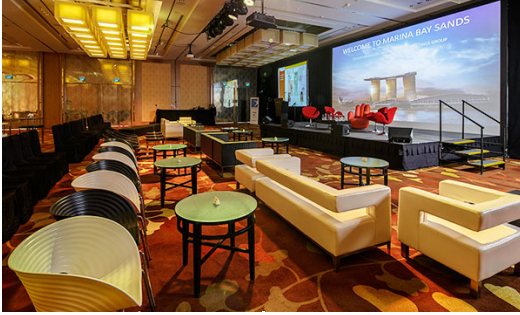
Sands Expo hosts Northstar Familiarisation Trip

20 top incentive buyers from North America were in town from 14 to 18 March 2016 for a familiarisation trip organised by the Singapore Exhibition and Convention Bureau (SECB) and Northstar Meeting Group.