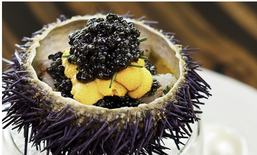
Waku Ghin by Tetsuya Wakuda ranks 6th on Asia's 50 Best Restaurants 2016

Marina Bay Sands continues to chart new records in the first quarter. Celebrity chef restaurant Sky on 57 was named "Best Business Lunch" in the Best of the Best Awards 2015 by Robb Report Singapore, while David Thompson's Long Chim Singapore was named "Best New Restaurant".